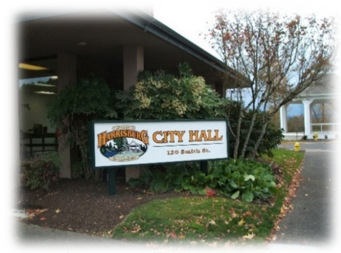
Harrisburg City Hall

Actions: Continue to publish annual budget and audit results on the City's website. Achieve annual audit with no reportable findings of non-compliance. Investigate software options that could provide greater transparency and access to city information and data.