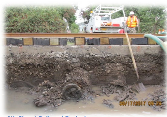
4th Street Railroad Project

Actions: Work with consultant provided through and by ODOT/TGM Grant to complete a new Transportation System Plan (TSP). Complete a prioritized project list of needed transportation improvements that address the UGB expansion and other changing conditions, while updating the Transportation SDC's