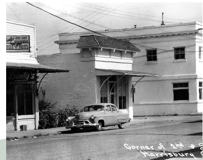
The Rampy Building at the corner of Smith & N. 2nd St. (195 Smith St.) & the current location of Gypsies Treasures.

What are the boundaries of the focus area? The boundaries of the Revitalization focus area are the traditional downtown core, (Including on 2nd St. to just past Macy St.) and a narrow core area along 3rd St. from Kesling to Territorial, but which also includes the Harrisburg Plaza area. You don't need to have a business in the boundaries to be involved!