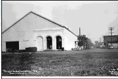
View from the Riverbank facing east up Smith St.

May & Senders Store, at 125 Smith St.; and the current home of Spot Hogg