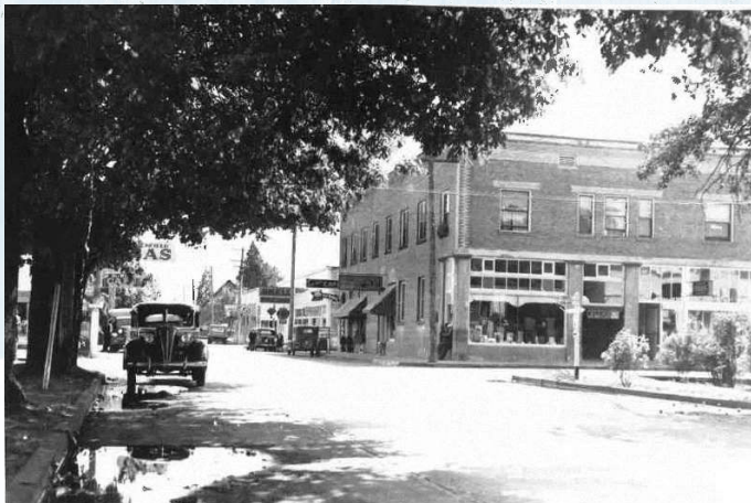
The corner of Smith & 3rd St's, facing South.....now the location of the J & S Art Company/"Harrisburg Gallery", and At-Home Real Estate