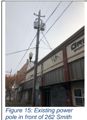
Figure 15: Existing power pole in front of 262 Smith

Existing electrical service for 262 and 274 Smith Street is an aerial service from existing power pole on Smith Street. No changes to electrical are required. Cable/telephone is aerial to residence with service box located on west side of building. No changes to cable/telephone