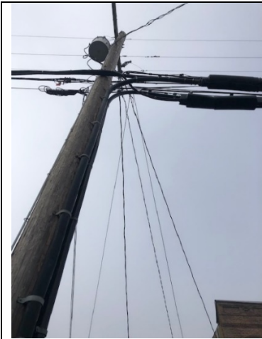
Figure 20: Existing power pole on S. 2nd Street and alley for aerial service to 162 S. 2 nd Street

162 S. 2nd Street receives power from an aerial line from an existing power pole located on 2 nd Street at the alley between Smith and Moore Street. The aerial goes to the weatherhead and then to the electric meter on the north side of the building. The existing aerial will go underground to the existing electric meter on the north side of the building. Contractor to provide conduit to north side of building through alley and provide new single-phase CT meter for underground electrical service. Contractor to install new 400 AMP & 200 AMP electrical panel and restore service.