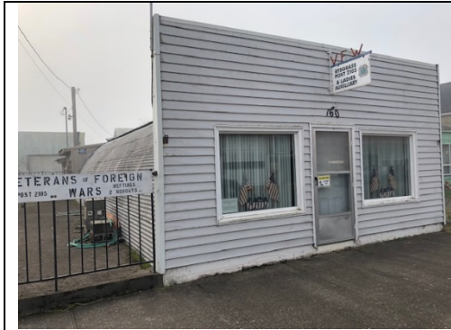
Figure 6: Front view of 160 Smith

160 Smith Street receives power from an aerial service from the overhead line on Smith Street. No electrical changes. Cable/Telephone service is aerial from Smith Street to pole in rear of building. Cable/telephone will be converted to underground. Contractor to install necessary cable/telephone facilities per construction plans and franchise utility's design and direction.