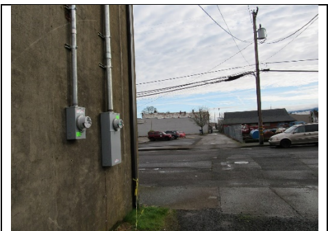
Figure 14: Existing electric meter at side of 190 Smith

125 N. 2 nd Street receives power from an aerial service from the alley between Smith Street and Monroe Street. No changes will be required for electrical service. Cable/telephone are from alley as well.