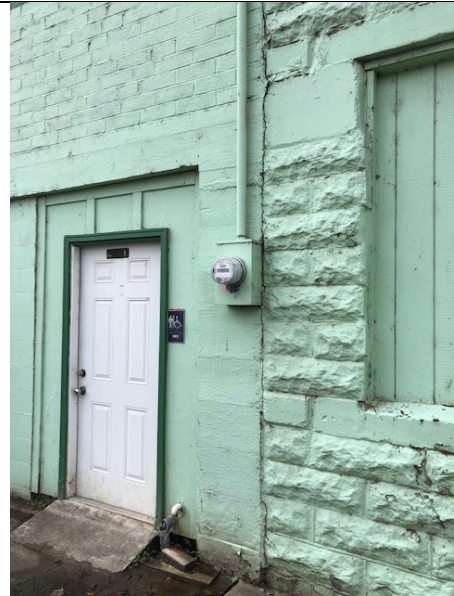
Figure 22: Existing electric meter on east side of 180 Moore Street