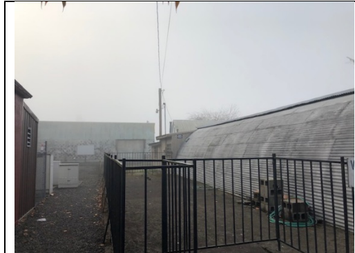
Figure 7: Side view of 160 Smith with power pole in background