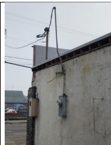
Figure 19: Existing electric meter on north side of 162 S. 2 nd Street