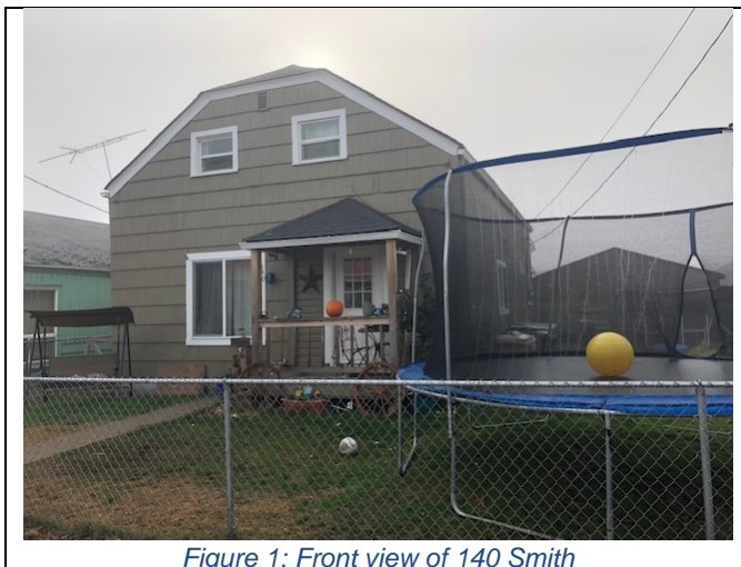
Figure 1: Front view of 140 Smith

Existing electrical service for 140 Smith Street is an aerial service from existing power pole on Smith Street. Cable/telephone is aerial to residence with service box located on west side of building. No electrical changes. Cable/telephone will be converted to underground. Contractor to install necessary cable/telephone facilities per construction plans and franchise utility's design and direction.