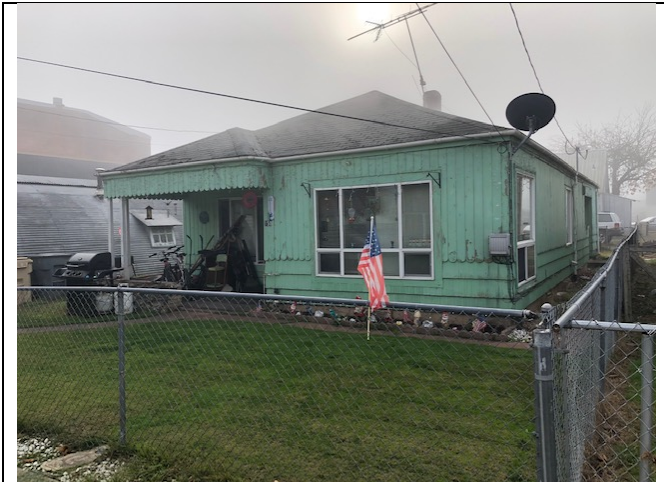
Figure 4: Front view of 150 Smith

150 Smith Street receives power from an aerial service from the overhead line on Smith Street. No electrical changes. Cable/Telephone service is aerial from Smith Street to front of building with service box located on the front of the residence. Cable/telephone will be converted to underground. Contractor to install necessary cable/telephone facilities per construction plans and franchise utility's design and direction.