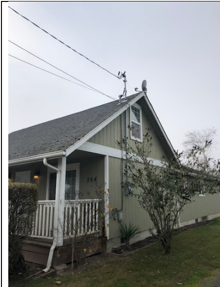
Figure 24: Existing electric meter on north side of 264 S. 2 nd Street