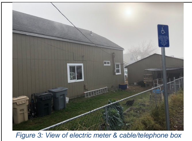
Figure 3: View of electric meter & cable/telephone box