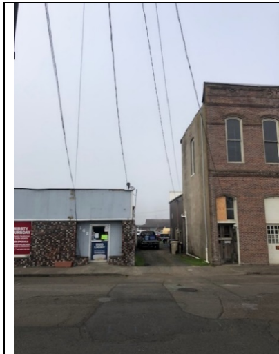
Figure 10: Rear view of 180 Smith from 2nd Street down alley