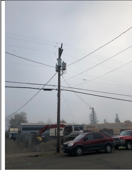
Figure 21: Existing power pole on 2nd Street and alley for aerial service to 180 Moore Street

180 Moore Street receives power from an aerial line from an existing power pole located on 2 nd Street at the alley between Moore and Macy Street. The aerial goes to the weatherhead and then to the electric meter on the east side of the building. The existing aerial will go underground to the existing electric meter on the east side of the building. Contractor to provide conduit to east side of building and provide new single-phase CT meter for underground electrical service. Contractor to install new 400 AMP electrical panel and restore service.