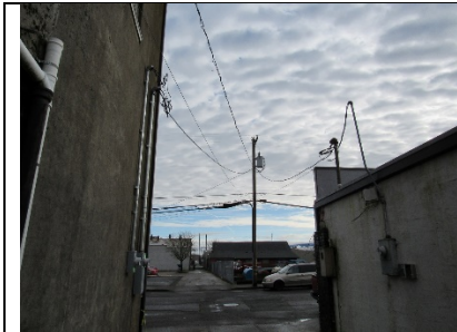
Figure 12: Existing power pole on 2nd Street and alley for aerial service to 190 Smith Street

190 Smith Street receives power from an aerial line from an existing power pole located on 2 nd Street at the alley between Smith and Moore Street. The aerial goes to the weatherhead and then to the electric meter on the east side of the building. The existing aerial will go underground to the existing electric meter on the east side of the building. Contractor to provide conduit to east side of building to provide new single-phase CT meter for underground electrical service. Contractor to install new 400 AMP & 200 AMP electrical panels and restore service.