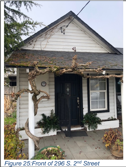
Figure 25: Front of 296 S. 2 nd Street

296 S. 2 nd Street receives power from an aerial line located on 2 nd Street between Moore and Macy Street. The aerial goes to the weatherhead and then to the electric meter on the front of the building. The existing aerial will go underground to the existing electric meter on the front side of the building. Contractor to provide conduit to front side of building and provide new single-phase CT meter for underground electrical service. Contractor to install new 200 AMP electrical panel and restore service. Cable/telephone will be underground as well. Cable/telephone will be installed underground in conduits and junction box to front of building.