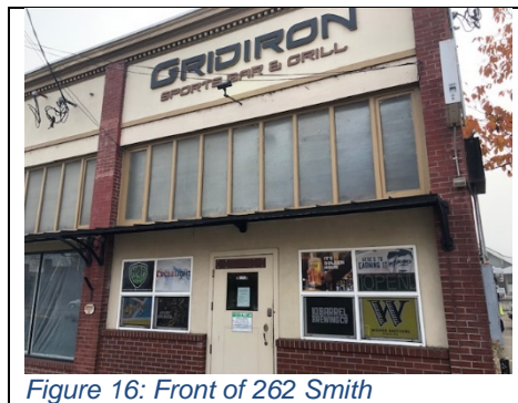
Figure 16: Front of 262 Smith