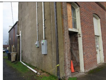
Figure 13: Side view of 190 Smith from 2nd Street