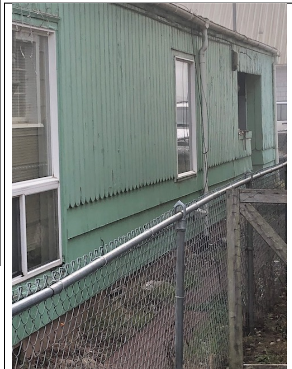
Figure 5: Side view of 150 Smith