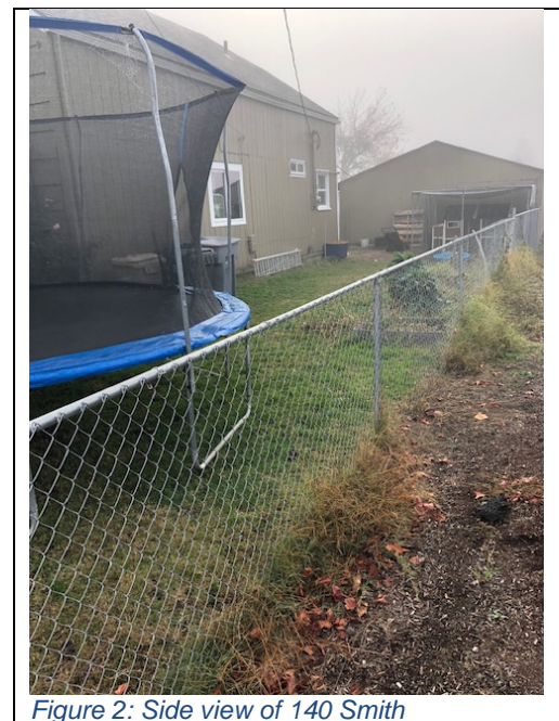
Figure 2: Side view of 140 Smith