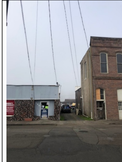
Figure 18: Front view of 162 S. 2 nd Street