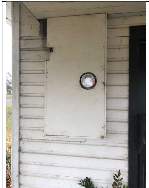
Figure 26: Existing electric meter on east side of 296 S. 2 nd Street

206 Macy Street receives power from an aerial line from an existing power pole at the SE corner of 2 nd and Macy Streets. No changes to electric will be required. No changes to cable/telephone will be required.