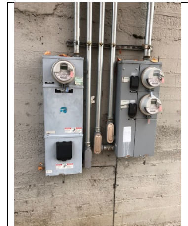
Figure 17: Existing electric meter on side of 262 Smith

294 Smith Street receives power from an aerial line from an existing power pole located on 3rd Street at the alley between Smith and Moore Street. The aerial goes to the weatherhead and then to the electric meter on the south side of the building. No changes to electrical are required. No changes to cable/telephone.