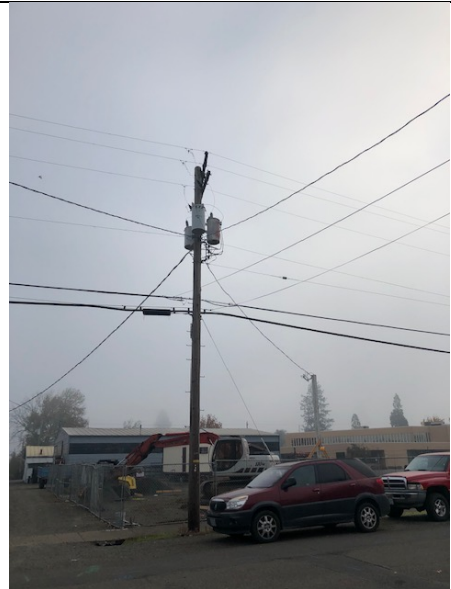
Figure 23: Existing power pole on S. 2nd Street and alley for aerial service to 264 S. 2 nd Street

264 S. 2 nd Street receives power from an aerial line from an existing power pole located on 2 nd Street at the alley between Moore and Macy Street. The aerial goes to the weatherhead and then to the electric meter on the north side of the building. The existing aerial will go underground to the existing electric meter on the north side of the building. Contractor to provide conduit to north side of building and provide new single-phase CT meter for underground electrical service. Contractor to install new 200 AMP electrical panel and restore service. Cable/telephone will be installed underground in conduits and junction box to front of building.